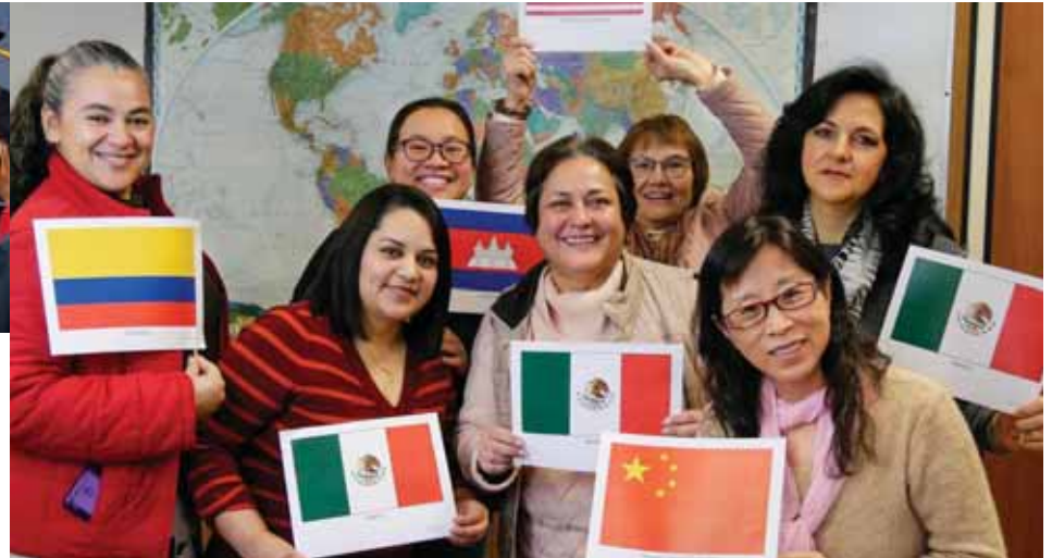
Every day, students from diverse backgrounds hone their skills to become better English speakers.