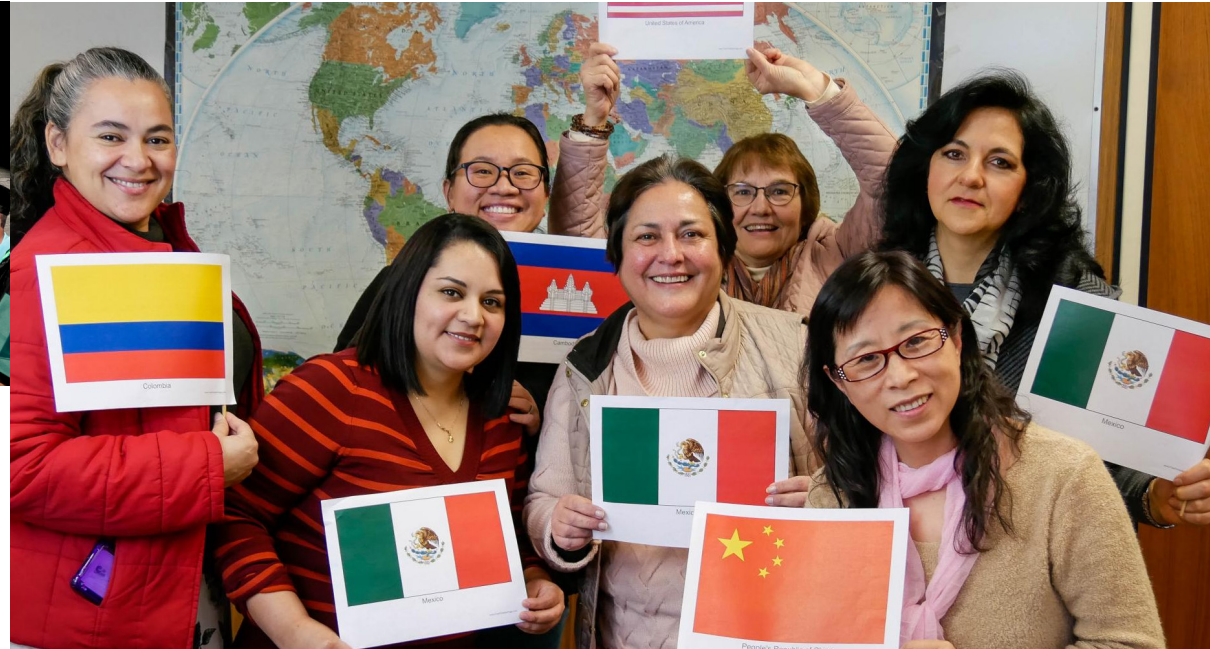
Every day, students from diverse backgrounds hone their skills to become better English speakers.