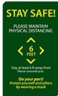
Re-Entry Door Sign B