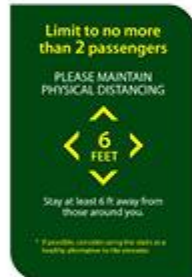
Re-Entry Elevator Sign E