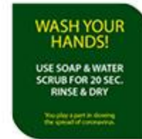
Re-Entry Sign D