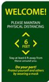
Re-Entry Door Sign A