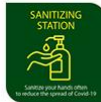
Re-Entry Sign G