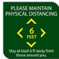
Re-Entry Sign F