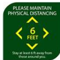
Re-Entry Sign K (Lollipop)