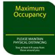
Re-Entry Sign C