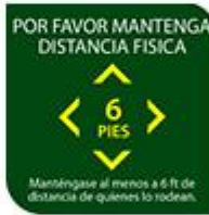
Re-Entry Sign F Spanish