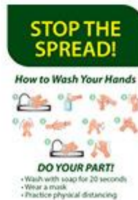
Re-Entry Bathroom Poster